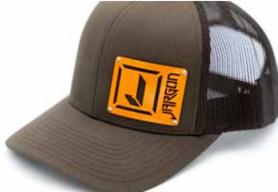
Metal Badge Trucker Brown | SKU: JARCAP10