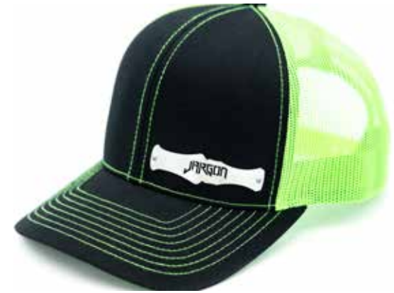
Metal Badge Trucker Lime Green / Black | SKU: JARCAP04