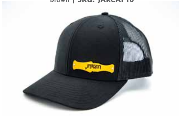
Metal Badge Trucker Black | SKU: JARCAP11