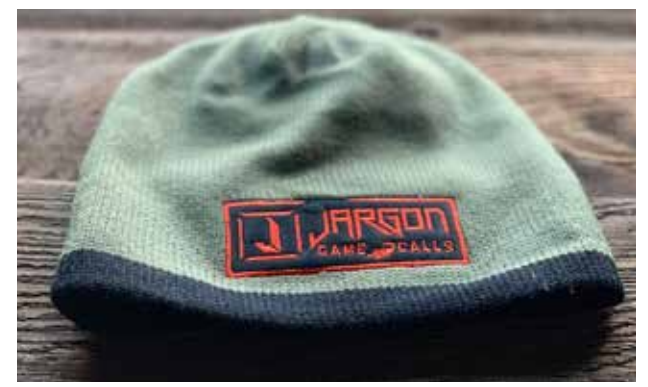
Jargon Beanie Orange logo patch | SKU: JARAB01