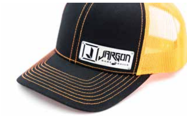
Metal Badge Trucker Black / Orange | SKU: JARCAP08