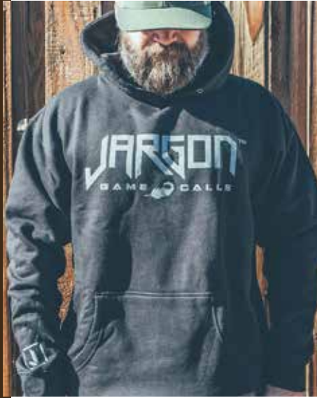
Logo Hoodie Black