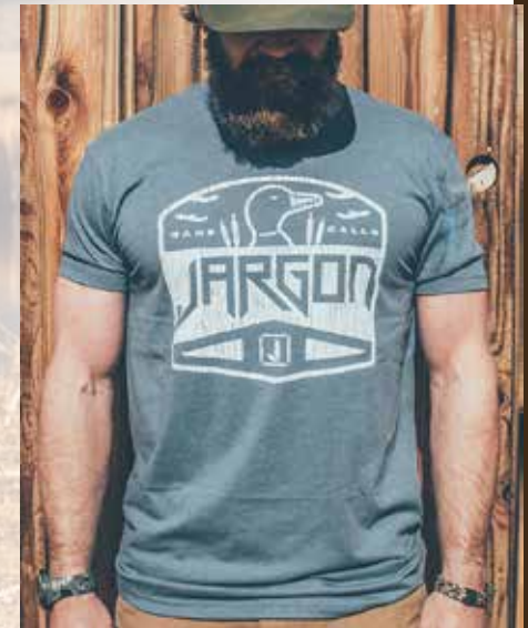
Lowland Tee Black | Indigo JARGONGAMECALLS.COM