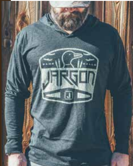
Lowland Hoodie Black | Indigo