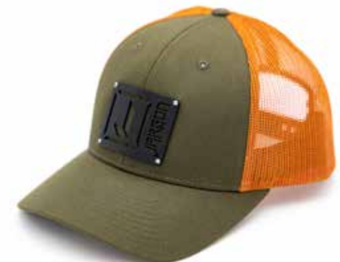
Metal Badge Trucker Olive / Orange | SKU: JARCAP09