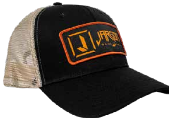
Jargon Patch Cap Black | SKU: JARCAP01