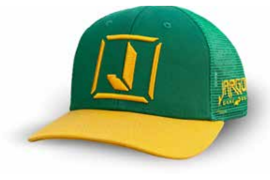
Mallard Green Yellow Cap Green & Yellow | SKU: JARCAP12