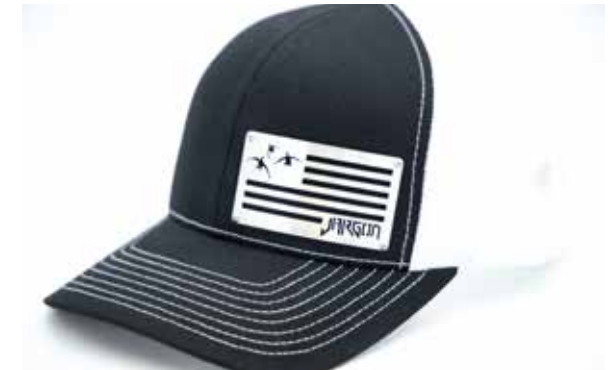
Metal Badge Trucker Black / White | SKU: JARCAP05