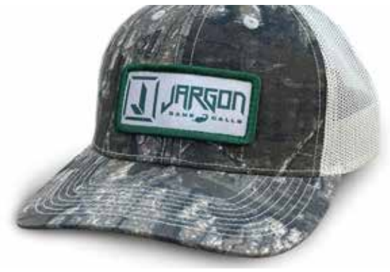
Realtree Timber Camo Realtree | SKU: JARCAP13