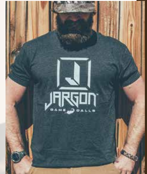
Logo Tee Black / Military Green