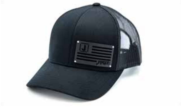
Metal Badge Trucker Blackout | SKU: JARCAP07