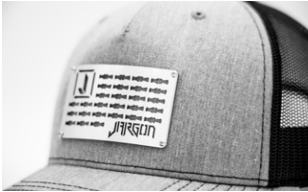
Metal Badge Trucker Heather Grey / Black | SKU: JARCAP06